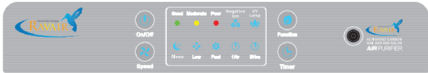
Wall mounted air purifier control panel

Thank you for choosing our product. This unit has been researched and designed by a professional design team for use in Nail Salons, Hair Salons, Beauty Salons and is also suitable for residential environments. The unit will remove specific fumes and gases such as Monomers (Methyl, Ethyl, Methacrylate) and Formadehyde, etc. It will also kill bacteria and removes dust and pollen while produces healthy air vitamins. This unit is also suitable for individuals who suffer with asthma or hay fever.