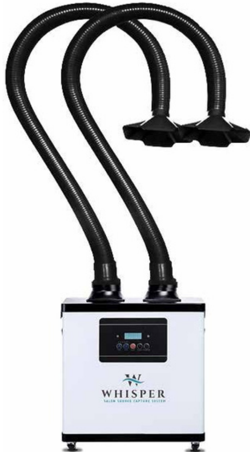
Model No: AVS-SCS-WD