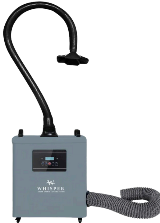
Model No: AVS-SCS-GS - V