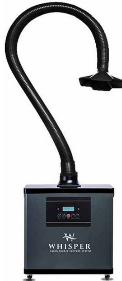
Model No: AVS-SCS-GS