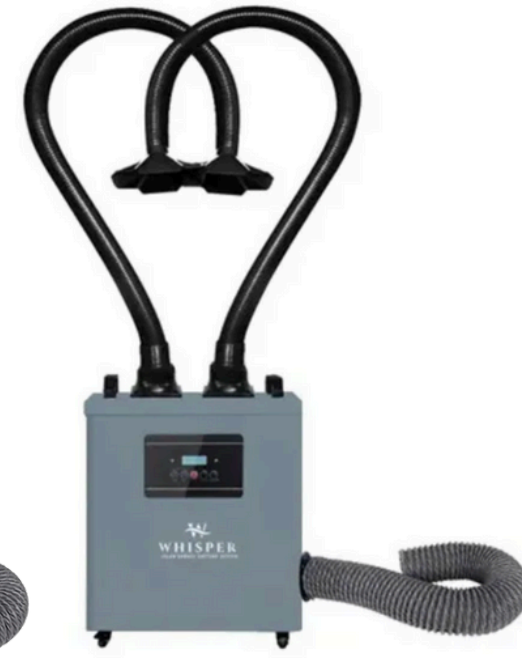
Model No: AVS-SCS-GD - V