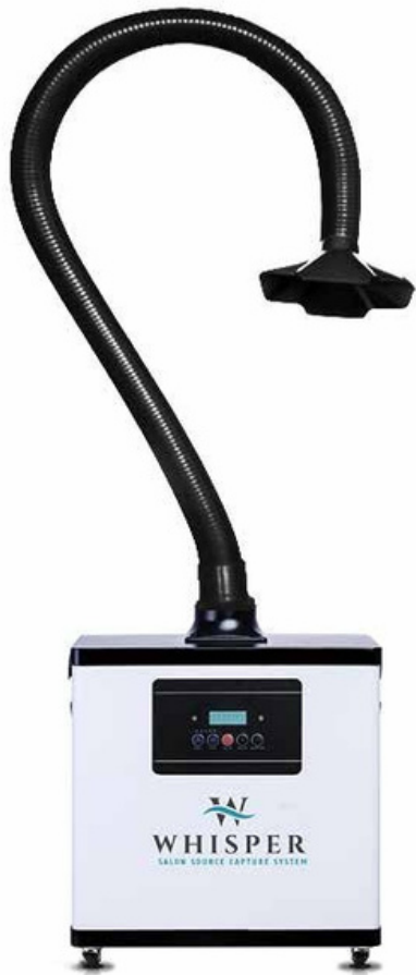
Model No: AVS-SCS-WS