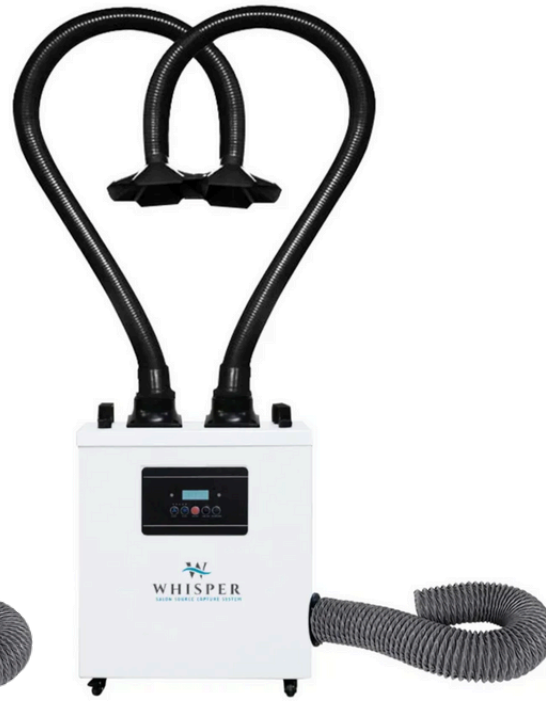
Model No: AVS-SCS-WD - V