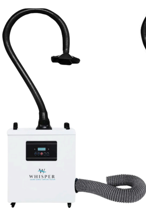
Model No: AVS-SCS-WS- V