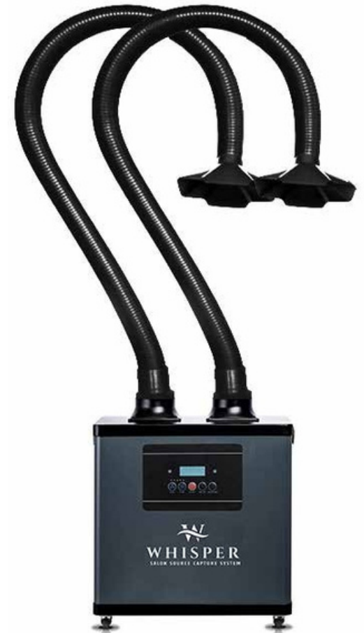
Model No: AVS-SCS-GD