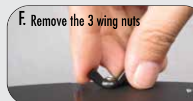
F. Remove the 3 wing nuts