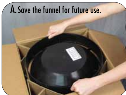
A. Save the funnel for future use.

After opening the box you will see a black plastic funnel sitting on top of your new air purifier (photo A). Be sure to save the funnel as you will need it for future carbon replacement (see the maintenance instructions section). Next, gather the plastic bag surrounding the air purifier (photo B). With two hands, firmly grip the plastic bag and lift your air purifier out of the box. You are now ready to begin using The One That Works™! Centrally locate The One That Works™ for optimal performance. Against the wall is fine, but do not place it in a corner.