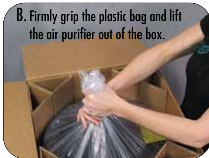
B. Firmly grip the plastic bag and lift the air purifier out of the box.