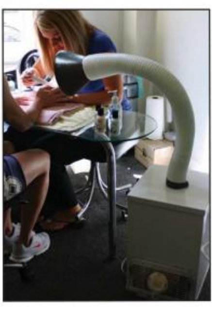
Source-capture systems, as the pictured here from Aerovex Systems, protect the breathing zone of the tech and the client.